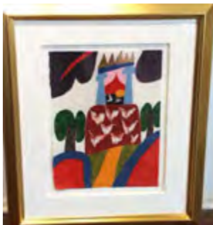
Chamba Bamba by Carol Summers color woodcut, 2004 17" x 12 3/4" (11381g)

The artist is fascinated with the landscape and its spectacular changes of season, its regal mountains and seas. These landscapes are featured in his woodcuts in an abstract form with bold color. At the present time Summers resides in California and Mexico.